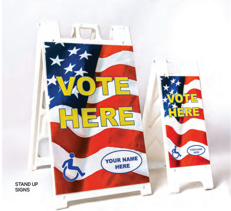
STAND UP SIGNS

Transform your space into an engaging and organized environment with our range of Signage and Displays that are both visually appealing and functionally essential. Our versatile display options cater to various settings, including election sites, offices, schools, and public spaces.