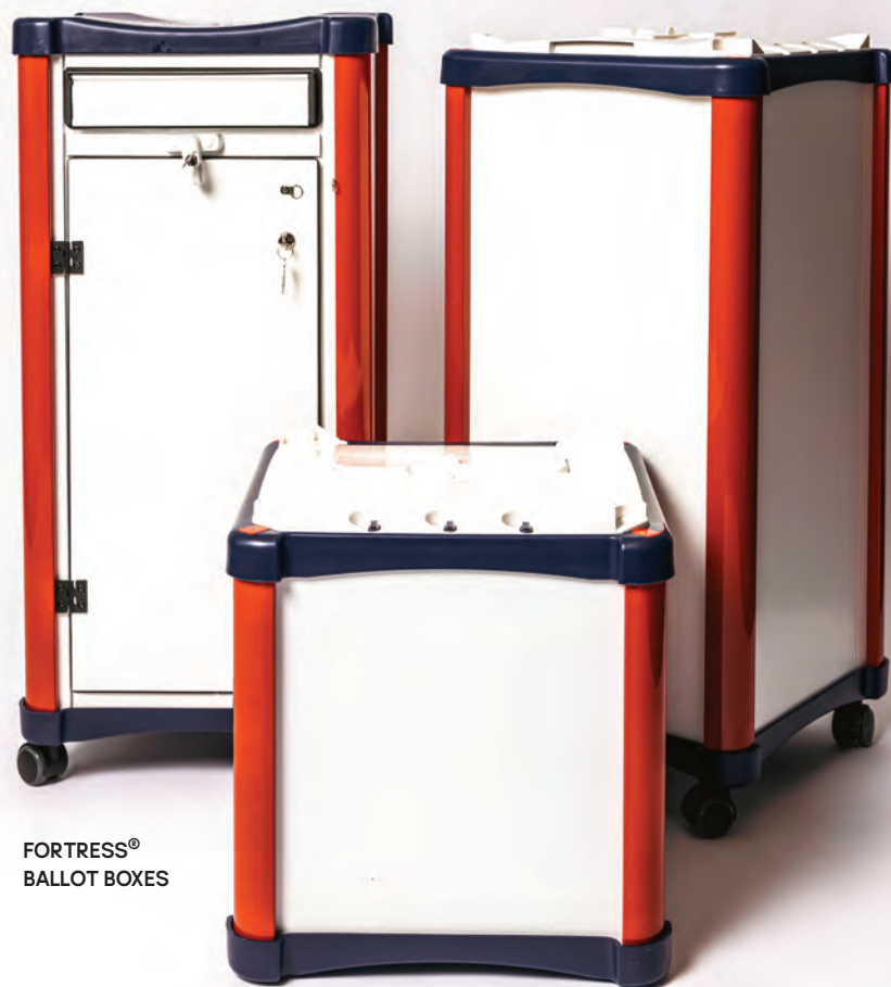
FORTRESS® BALLOT BOXES

Inclusion Solutions' suite of portable Ballot Boxes are ultra-durable and highly secure. Our Fortress Suite ranges from tabletop indoor boxes to our robust weather-resistant ultra-secure Fortress 1000. Stackable Orion boxes and insert bags for easy ballot collection create a product line of boxes that meet all needs.