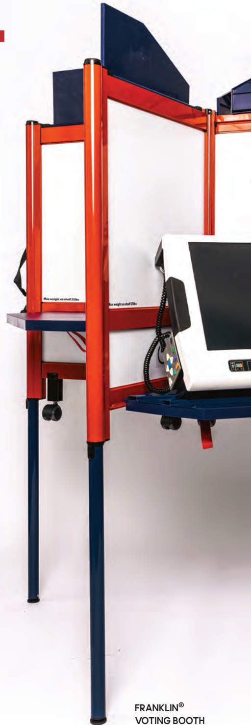
FRANKLIN® VOTING BOOTH