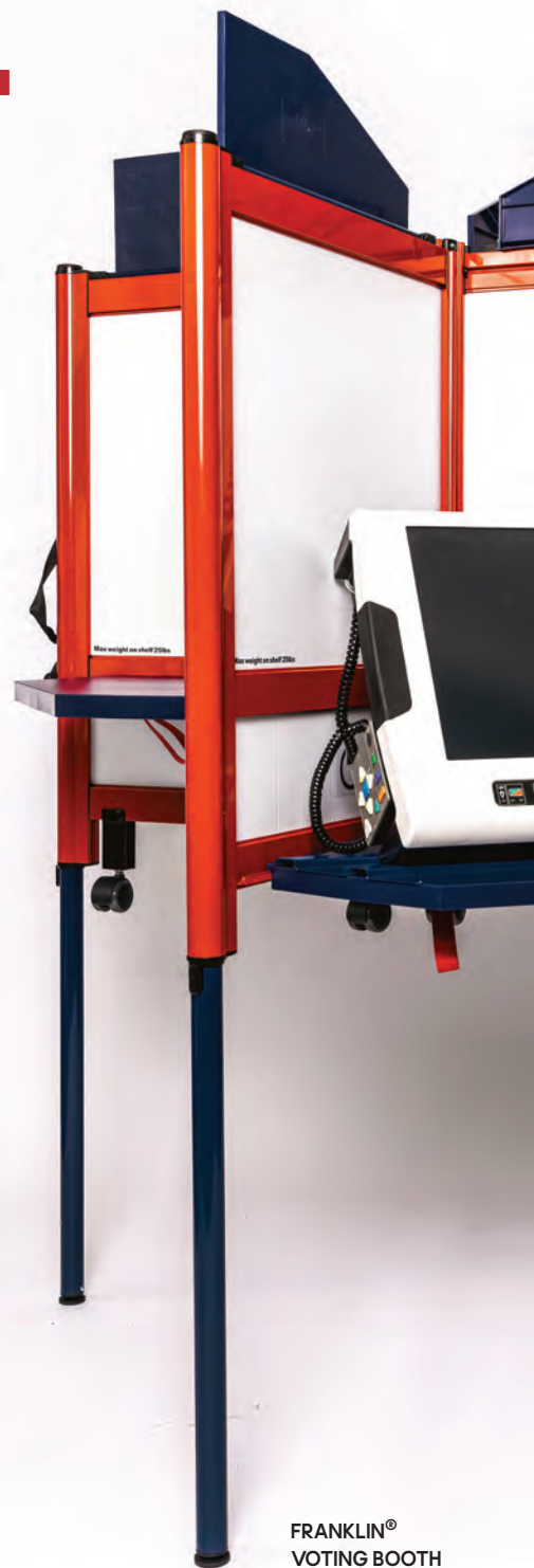
FRANKLIN® VOTING BOOTH