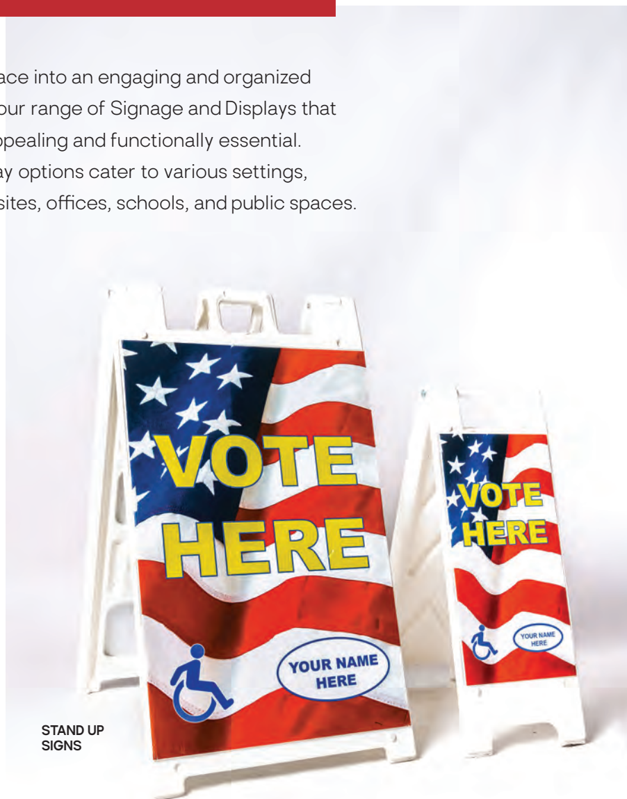
STAND UP SIGNS

Transform your space into an engaging and organized environment with our range of Signage and Displays that are both visually appealing and functionally essential. Our versatile display options cater to various settings, including election sites, offices, schools, and public spaces.